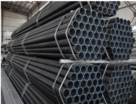
Example of Raw Steel Tubing